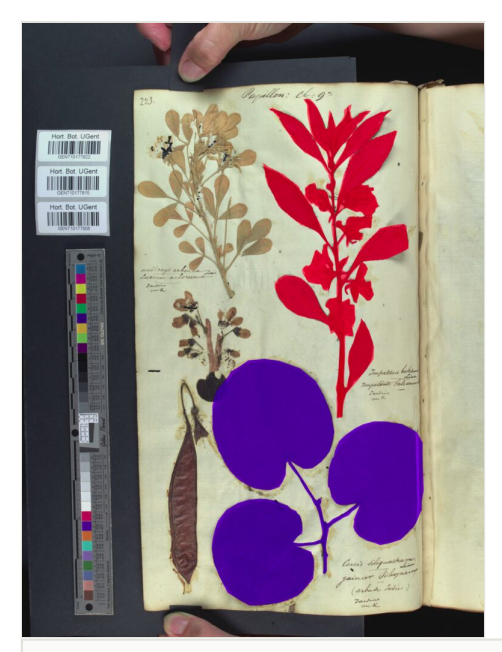
Figure 1. An example of multi-specimen herbarium page with handwritten text descriptions around it.

tremendously. It also involves a great deal of time and effort if they are to be enriched manually. In this work, we propose a pipeline that can automatically detect, identify, and enrich plant species in multi-specimen herbaria.